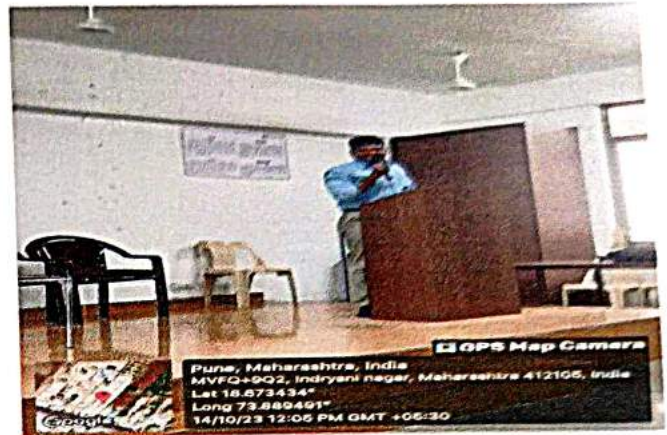
Resource Person interacting with the students