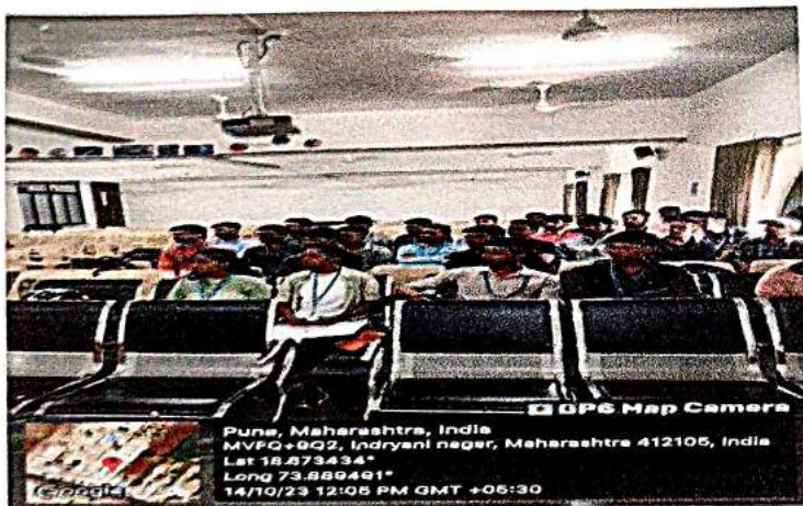
Participants of Guest Lecture