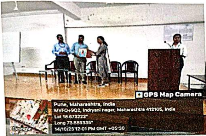
Felicitation of the Resource Person