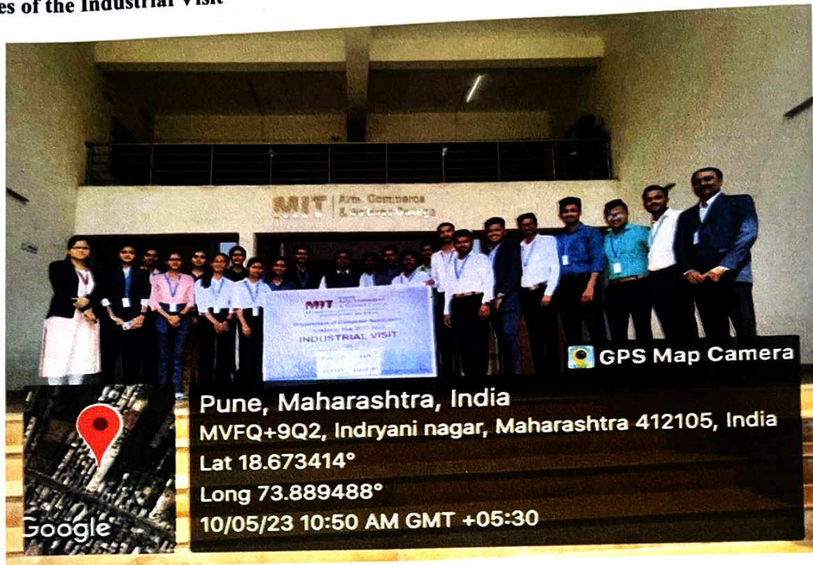
Students ready for Industrial Visit