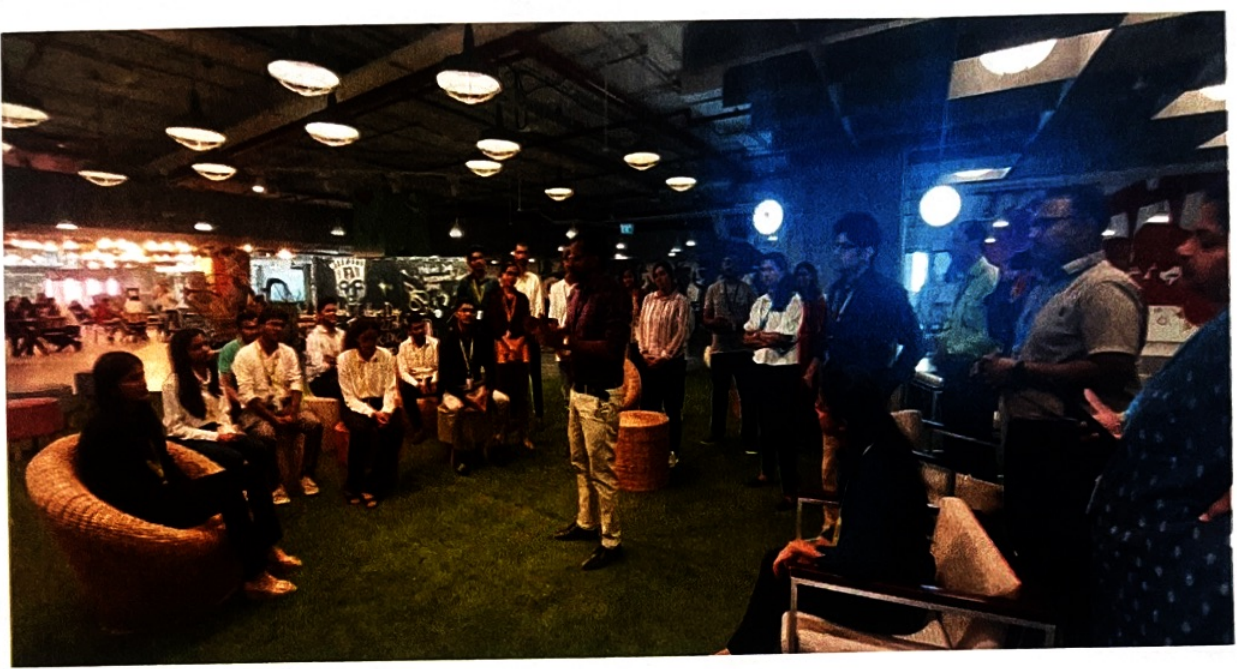
Barclays Employees explaining concepts regarding Interview