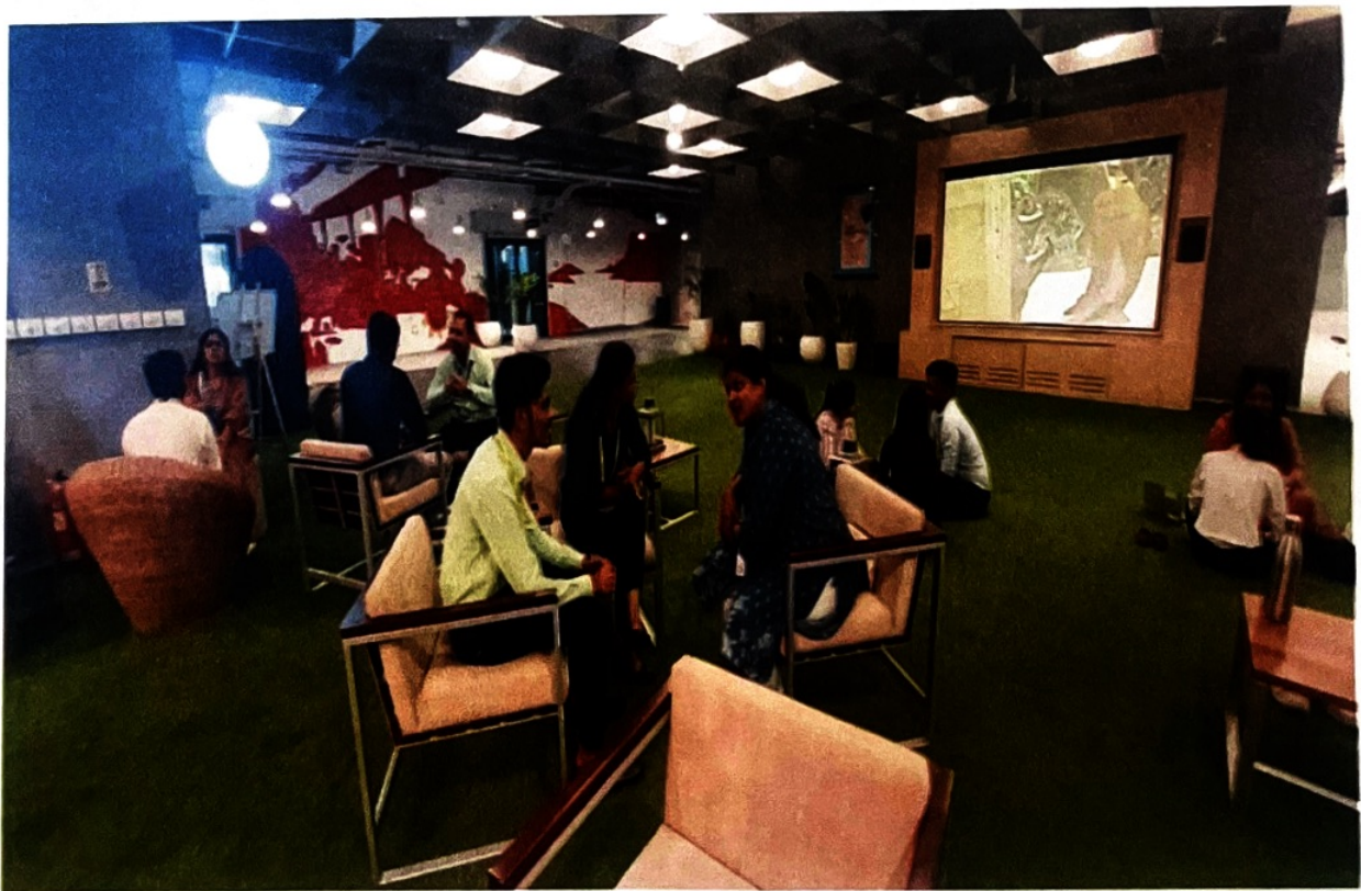
Individual Interaction with students