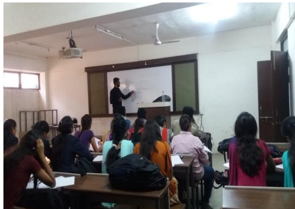
Special Training Program conducted by Yashashree Competition Zone during 31/12/2015 to 21/04/2016