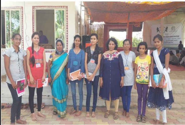
Faculty along with participant students at Mandar Krishi Tantra Niketan Kolambi for seven days residential Camp for Career Guidance on Competitive Exams