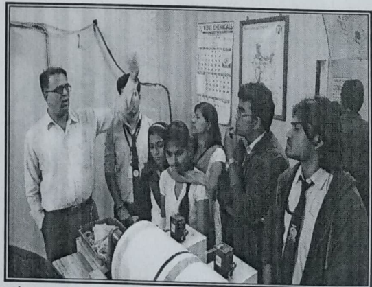
Students and Faculties observing various research equipments