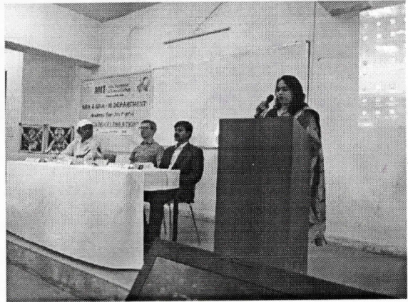
Event Coordinator anchoring