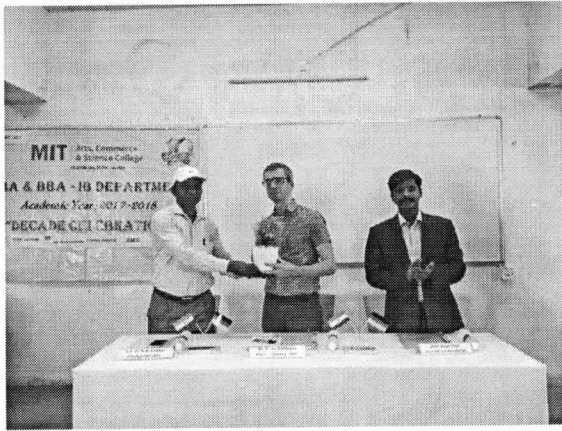
Guest Felicitation by Principal