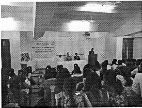
Guest Introduction by Faculty