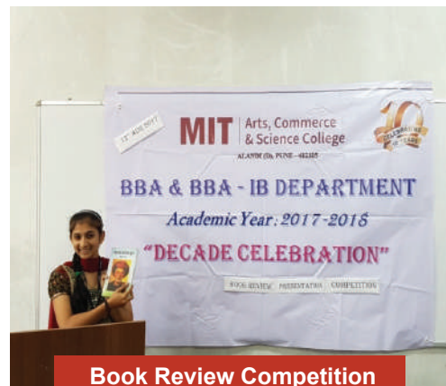
Book Review Competition