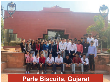
Parle Biscuits, Gujarat