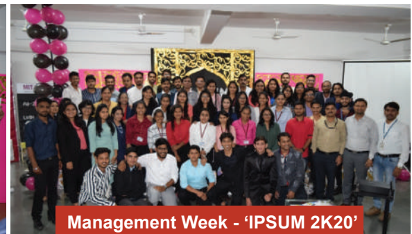
Management Week - 'IPSUM 2K20'