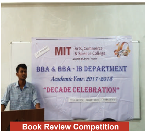
Book Review Competition