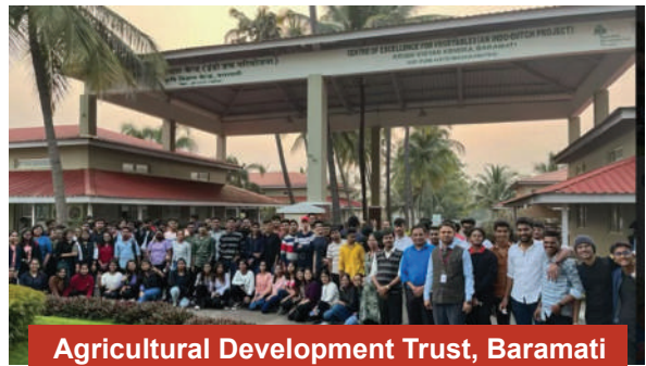
Agricultural Development Trust, Baramati