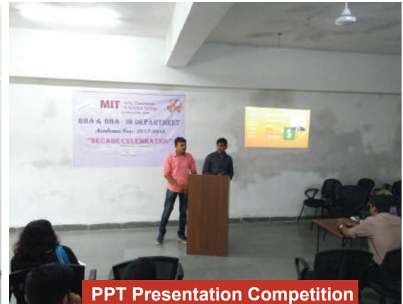
PPT Presentation Competition