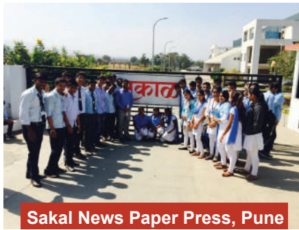
Sakal News Paper Press, Pune