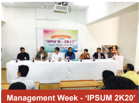
Management Week - 'IPSUM 2K20'