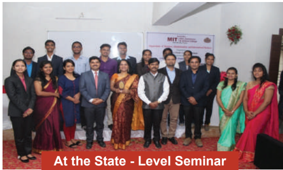
At the State - Level Seminar