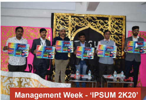
Management Week - 'IPSUM 2K20'