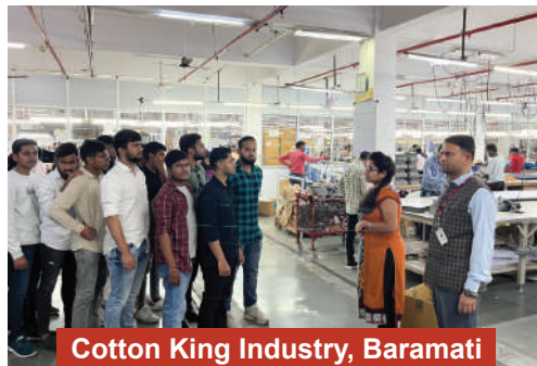
Cotton King Industry, Baramati