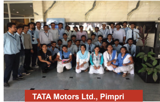
TATA Motors Ltd., Pimpri